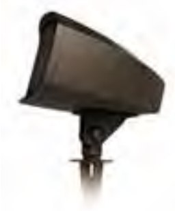
PRO-650T-LS 6.5" 2-Way Landscape Satellite