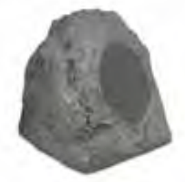
PRO-500T-RK 5" 2-Way Rock Speaker