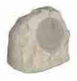
PRO-650T-RK 6.5" 2-Way Rock Speaker